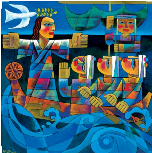
Peace, Be Still by He Qi (1992)