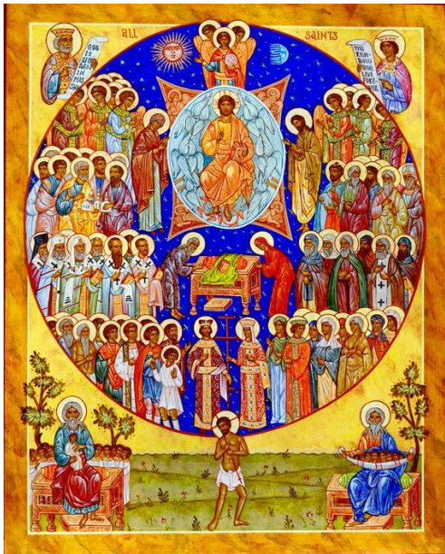
All Saints Icon

A Prayer for the Person called to be our Bishop God of All Hopefulness, we hold up before you this day the person you are calling to be the next Bishop of the Diocese of Glasgow and Galloway. We pray that in this time when their identity may be known to you alone, that you will grant them courage, wisdom, grace, and the peace that passes all understanding as they prepare to begin their journey with us. Holy One, we pray that you would open their heart to hear the Spirit's still small voice saying, "This is the way, walk in it." Jesus, give them words to speak, give us all ears to hear, and help us to see all the ways you will move us through their leadership. God, we also hold up their family and all those who love them because we know this is not a call one accepts lightly or alone – bless them in all of their relationships as they prepare to walk in our midst on your path of light. We pray this in the name of God who creates, redeems, and sustains us all. Amen.